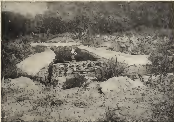
One of our Pools and a Water Nymph